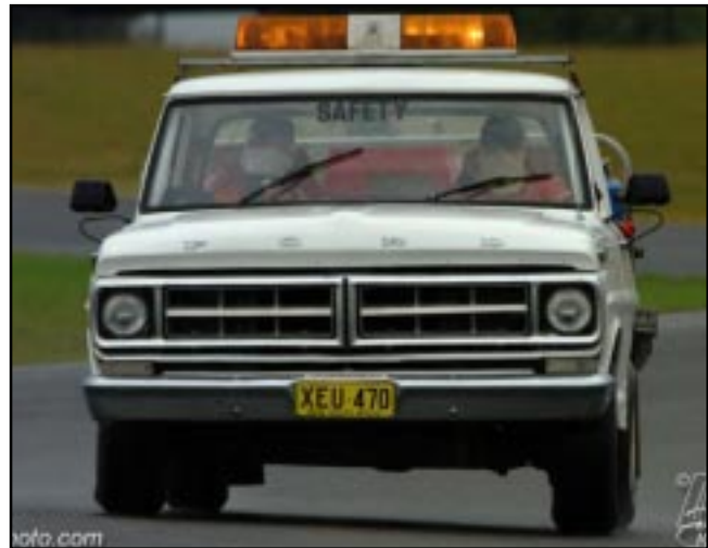
Fire and rescue officials.

recommend a reduction in the licence level applied for. If the training conditions have not been met at the licence expiry date, the licence level will be reduced.